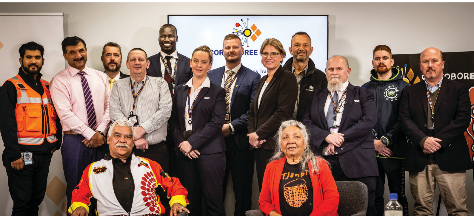
Group - Canberra

Corroboree Certis Indigenous Corporation acknowledges the Traditional Owners of the land both past and present.